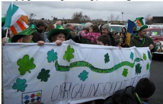
CETNS families enjoying a day out at the Carrigaline St. Patrick's Day parade.