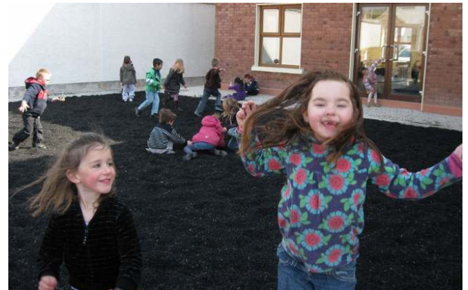
Senior Infants celebrating the new yard.